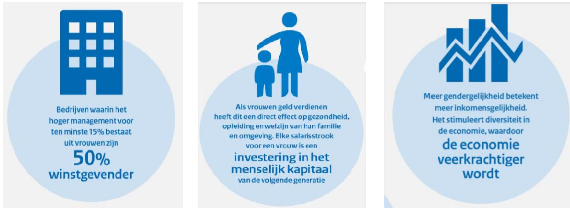
Illustration: why promoting gender equality is important (RVO, 2022)

Research has shown that the global economy, and thus the realisation of organisations' ambitions, is boosted and society benefits from gender equality (see images below). It is not without reason that the European Commission (EC) has chosen to work towards promoting gender equality.