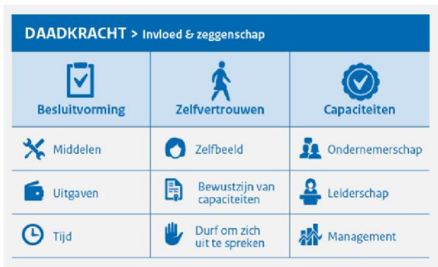
Picture: what it takes to promote gender equality

The figure below shows which factors promote gender equality (on the sub-themes of decision-making, self-confidence and capabilities).