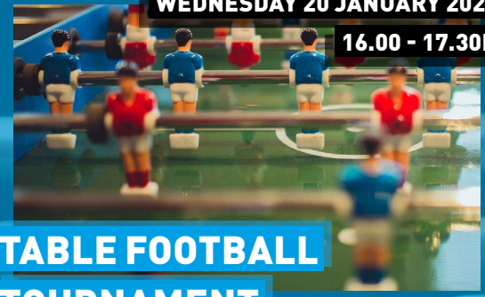
TABLE FOOTBALL TOURNAMENT

You used to play table football a lot at school? Nowadays still occasionally in the sports canteen or in the local pub? Pick up a friend who is also studying at the HZ and sign up quickly to see if you are the best table football players at the HZ! You can also join on your own! On the day of the tournament you will be linked to a teammate.